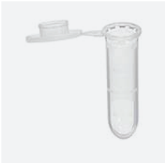
Extracting the milk sample